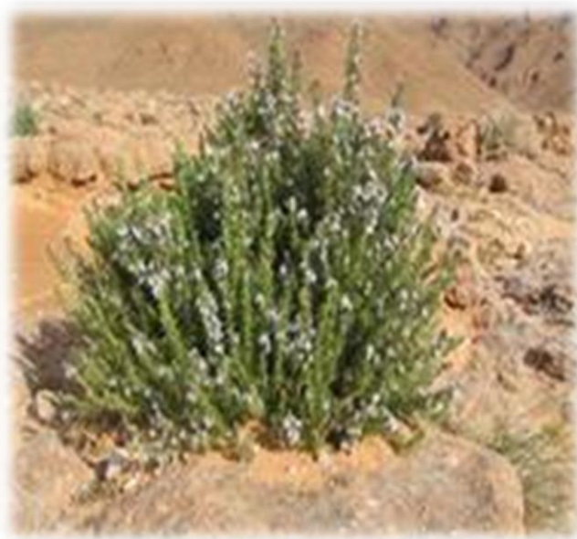
Figure II.2 : Shrub of Rosmarinus officinalis (Makhloufi, 2009)