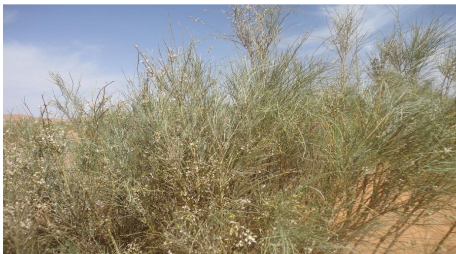
Figure II.3 : Shrub of Retama raetam ( Mekki, 2016 )

The Retames have a great symbiotic capacity, being part of the fabaceae family, their roots end in small swellings called nodules, which are home to a very diverse microbial fauna. This symbiotic association allows them to fix atmospheric nitrogen and convert it to assimilable organic nitrogen (NO 3 ).