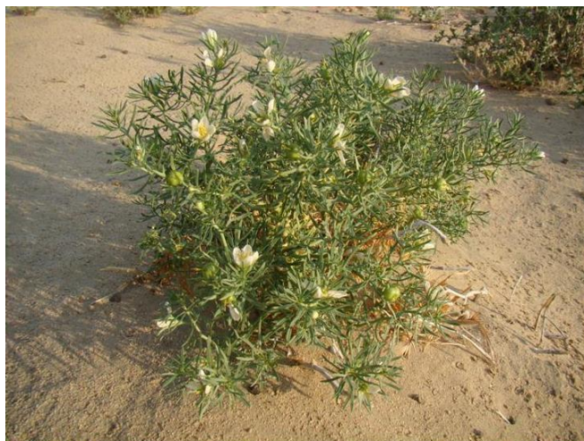
Figure II.1 : Shrub of Peganum harmala ( Rezzagui, 2012 ).

and results in a fruit which is a spherical capsule, three-celled, 6 to 8 mm depressed at the top, surrounded by persistent and opening sepals by 3 or 4 valves to release the seeds. Seeds: numerous, small, angular, subtriangular, dark brown in color, including the outer seed coat is reticulate, has a bitter flavor; they are harvested in summer ( Chopra et al., 1960; Quezel & Santa, 1963; Ozenda, 1977 ).